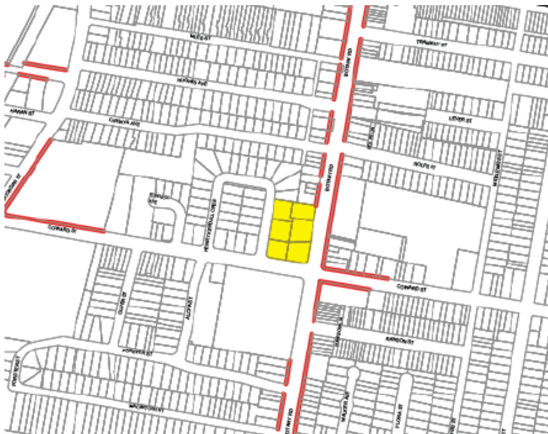
Proposed Active Street Frontages Map