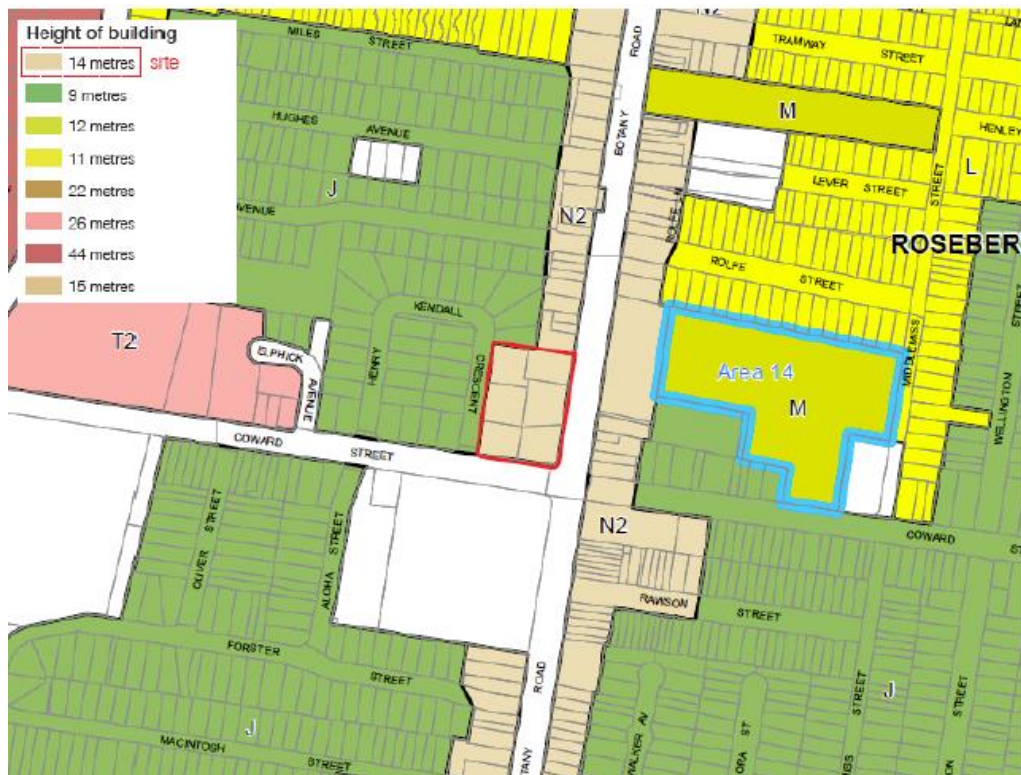
Existing Height of Buildings Map