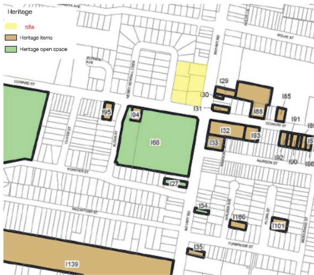
Existing and proposed Heritage Map