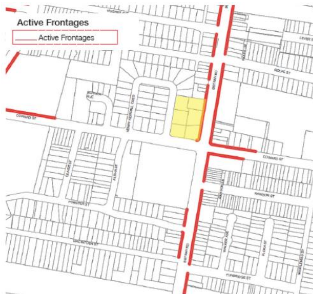
Existing Active Street Frontages Map