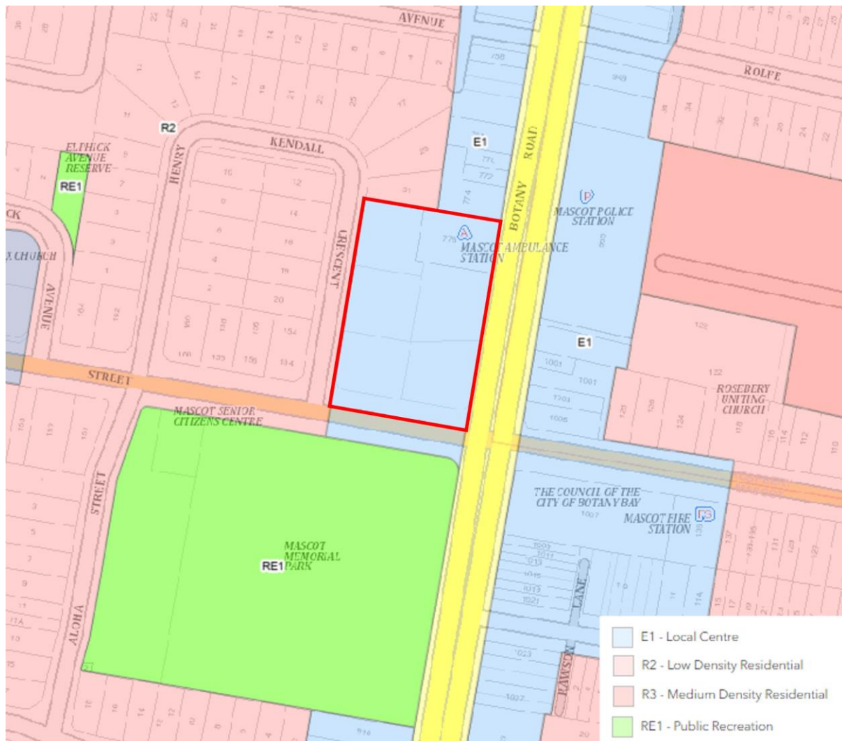
Existing and Proposed Zoning Map